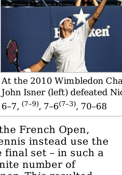
At the 2010 Wimbledon Championships John Isner (left) defeated Nicolas Mahut (right) 6–4, 3–6, 6–7, (7–9) , 7–6 (7–3) , 70–68

longest tennis match records by duration or number of games. The 1973 introduction of the tiebreak reduced the opportunity for such records to be broken. However, among the Grand Slams, only the US Open uses the tiebreak in the final set; the Australian Open, the French Open, Wimbledon and Olympic tennis instead use the advantage set rules in the final set – in such a set there can be an indefinite number of games until there is a winner. This resulted, for example, in the record-obliterating Isner vs. Mahut match at Wimbledon 2010.