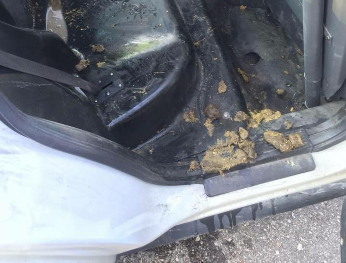
Shelby Township Police Department Facebook page