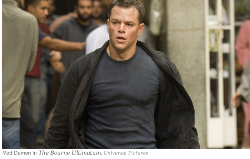
Matt Damon in The Bourne Ultimatum.

It has been eight years since covert super-soldier Jason Bourne disappeared at the end of 2007’s The Bourne Ultimatum — and it is still the most successful film in Matt Damon’s career. The Bourne Legacy continued the franchise with a new character and a new star (Jeremy Renner) in 2012, but next week, Damon will start production on the fourth film featuring Jason Bourne, due out in July 2016.