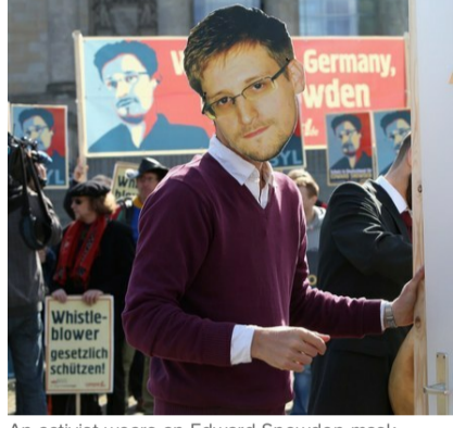
An activist wears an Edward Snowden mask during a demonstration in favor of Snowden as a witness in German NSA hearings on May 8, 2014.

To answer that question, the 44-year-old actor said that he and director Paul Greengrass would “revisit the idea” of making another Bourne movie every few years, but it wasn’t until the NSA whistleblowing revelations from Edward Snowden that the duo came up with a new story for Jason Bourne.