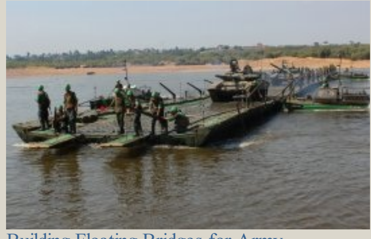
Building Floating Bridges for Army