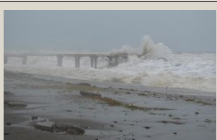
Storm in Sukhumi