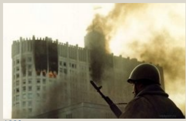
Building Floating Bridges for Army