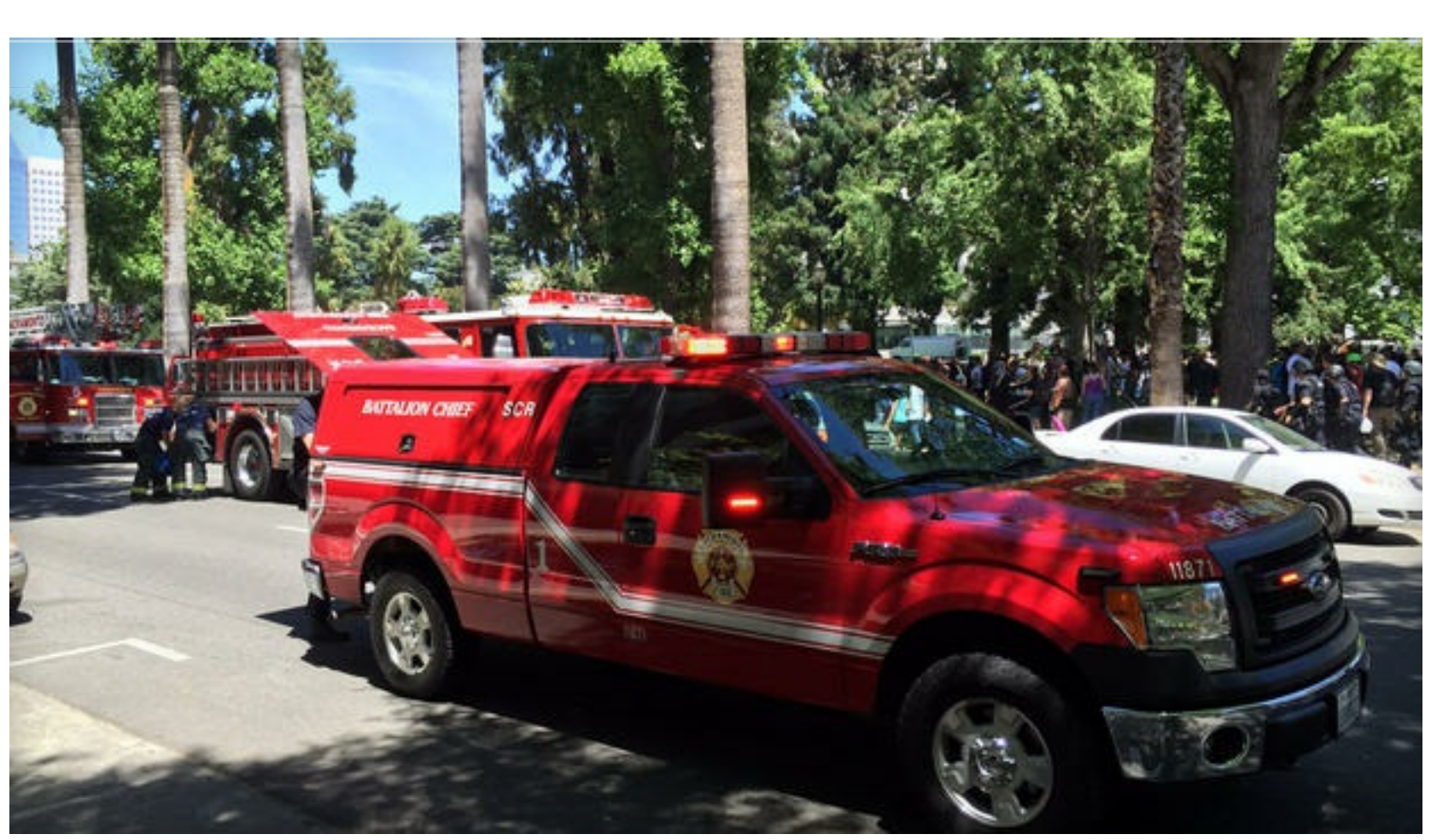
Sacramento Fire Department vehicles sit outside the California state capital in this picture tweeted by the department on June 26, 2016.

Comment / Share / Tweet / Stumble / Email