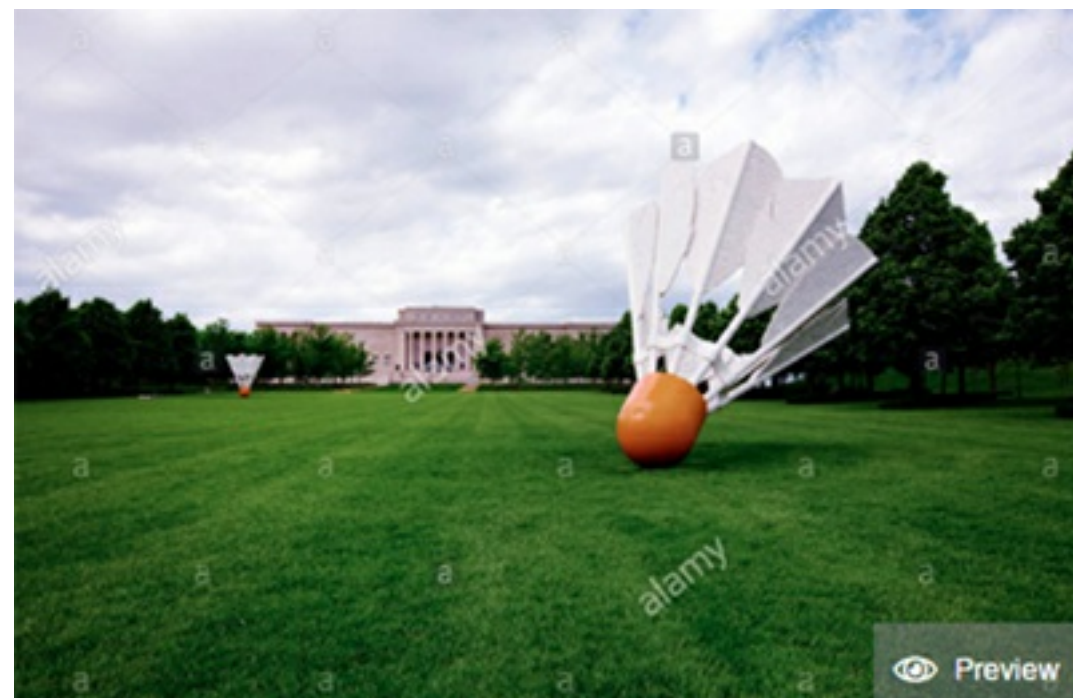
Highsmith was sent a demand letter from Getty over this photo of hers.

However, Highsmith says she never abandoned her photo copyrights, and says she found out about Getty Images charging for her photos when she was sent a letter from Getty that demanded she pay for her own photo that was being displayed on her own website.