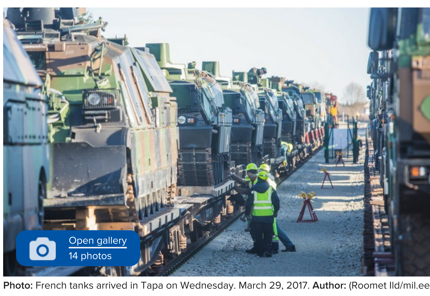
Photo: French tanks arrived in Tapa on Wednesday, March 29, 2017.