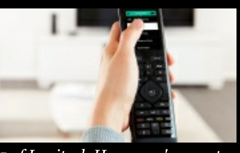
5 of Logitech Harmony's remotes ever are discounted on Amazon