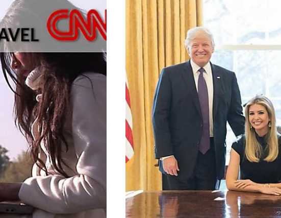
Ivanka Trump in the Spotlight Work+Money