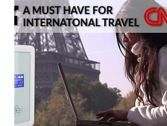
GeeFi: Unlimited Wifi in 100+ Countries. Blazing Fast 4G/LTE. Goodbye Hefty... www.geefi.co