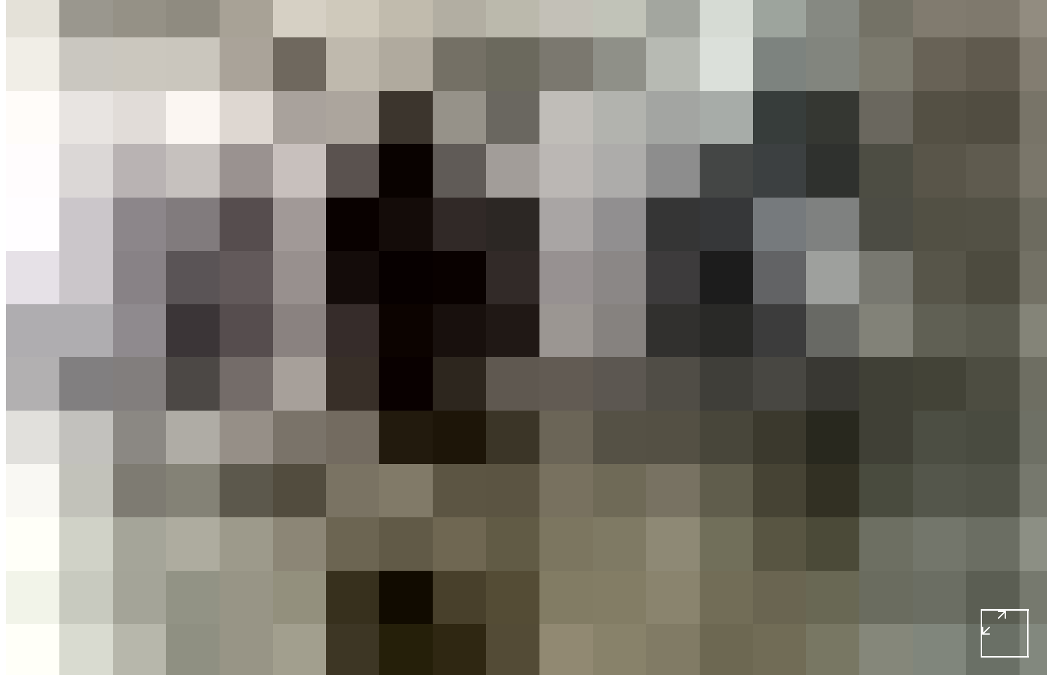
Ludmila Sklyarevskaya, who denied voting multiple times, casting a ballot at polling station number 215 (L) and casting a ballot at polling station number 216, in Ust-Djeguta.

Another woman, wearing sparkly heels, also appeared to vote twice on Sunday.