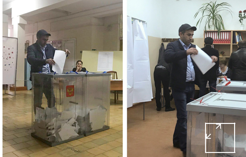
Slideshow (6 Images)

Official results released on Monday showed the three polling stations had an average turnout of 81.5 percent and delivered a majority for Putin of 89.86 percent. National turnout was 67 percent, according to the central election commission.