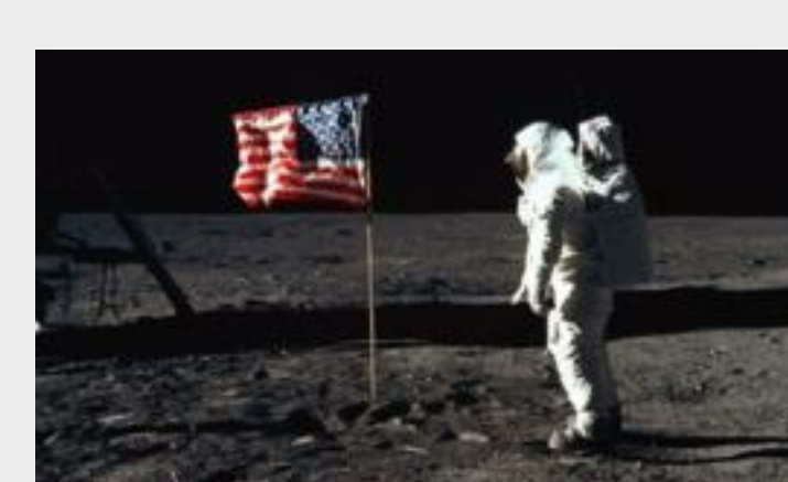
Can anyone 'own' the Moon?