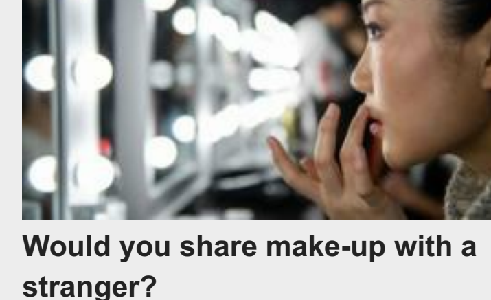
Would you share make-up with a stranger?