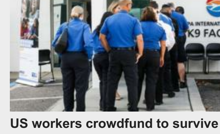
US workers crowdfund to survive shutdown