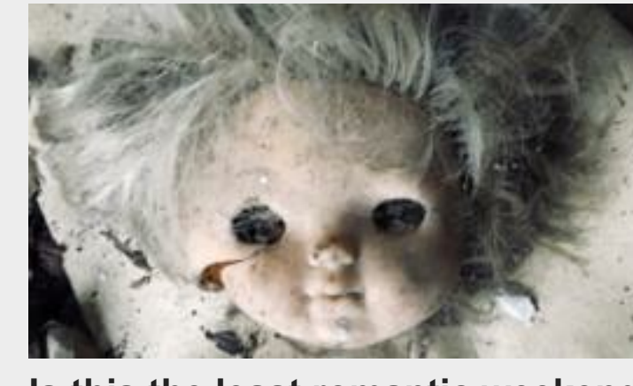
Is this the least romantic weekend ever?