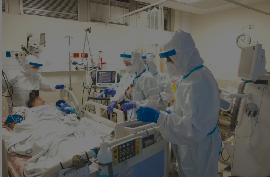
SHAARE ZEDEK hospital team members in the coronavirus ward.