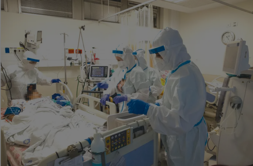
SHAARE ZEDEK hospital team members in the coronavirus ward.