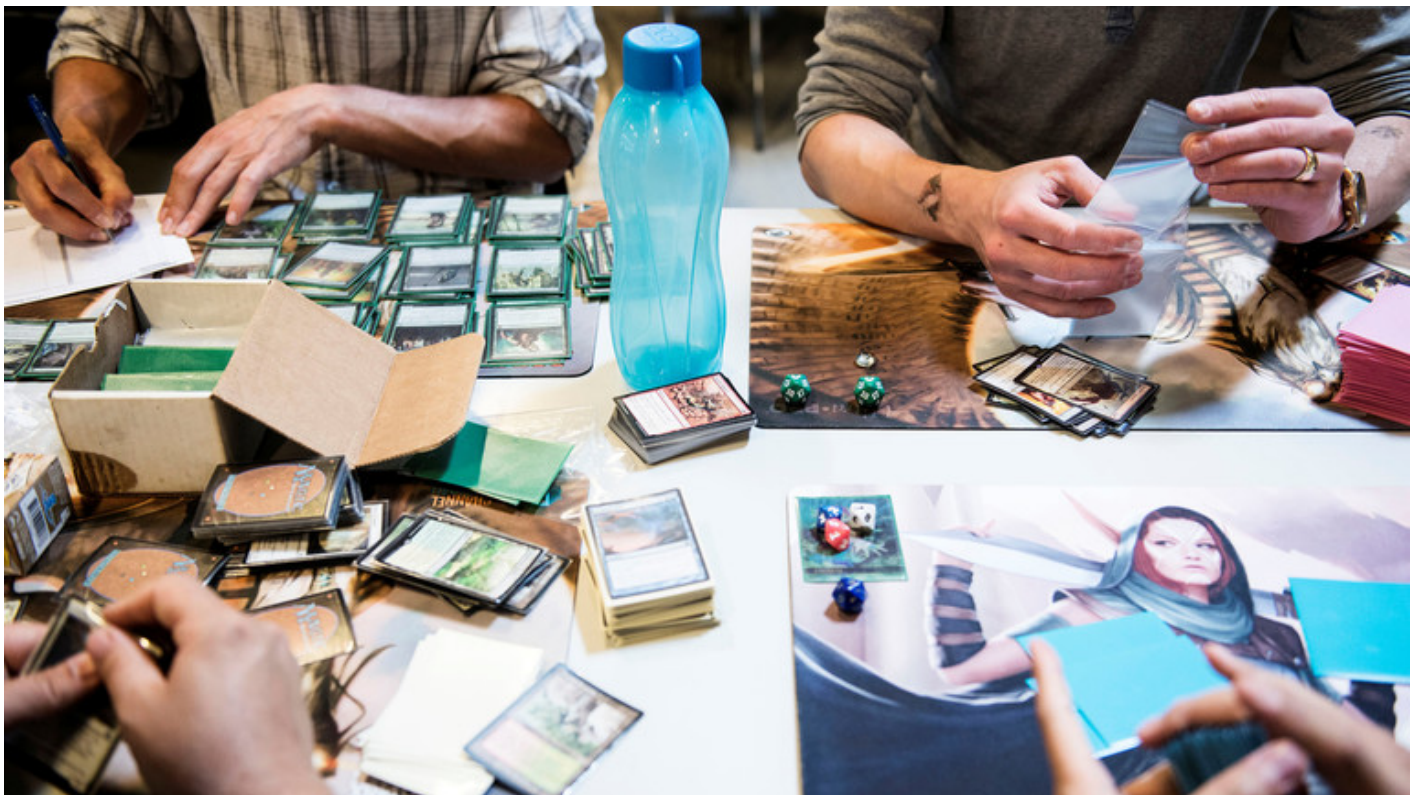
FILE PHOTO. © Reuters / Scanpix Denmark / Sarah Christine Norgaard