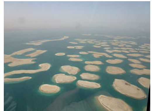
Undeveloped islands on 11 April 2015