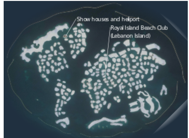
The World islands map, annotated with existing developments