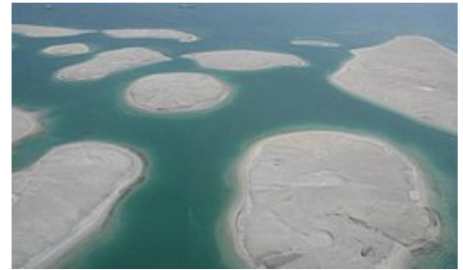
Undeveloped islands on 1 May 2007