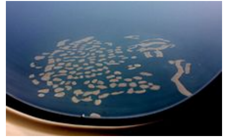
The World 2010 (airview)

The plan was for utilities to be routed under water, with water plants at each of the hubs pumping fresh water to the islands. Power was to be supplied by the Dubai Grid and distributed through underwater cables, however as of February 2015 no cables had been laid, so that developers currently have to provide their own power from diesel generators. Wastewater and refuse systems are an individual concern for each island. [26]