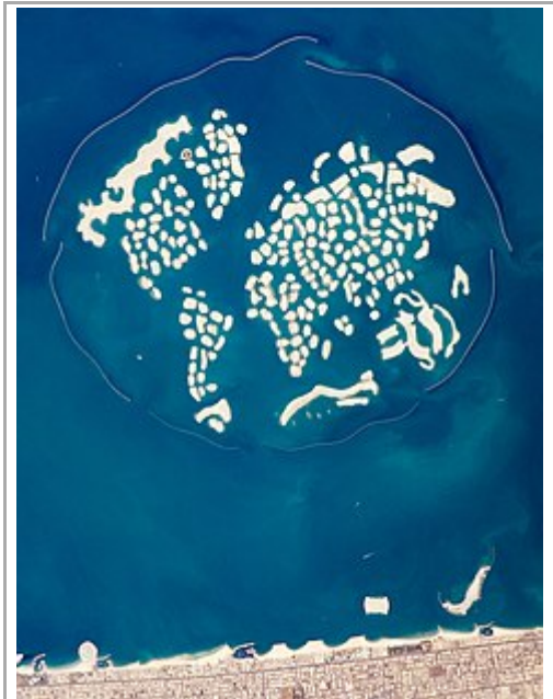
View of The World in 2010