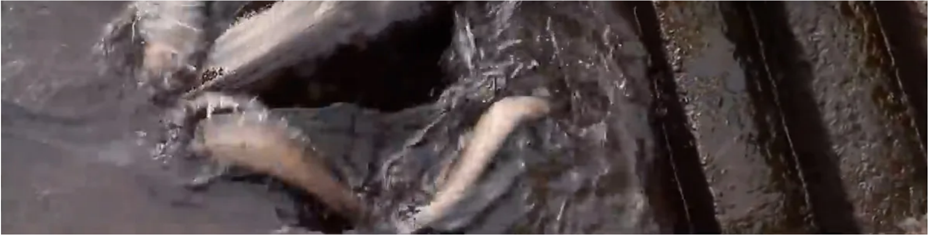
'Boy Pets Creature' Ad Misleads. Here's the Original Video