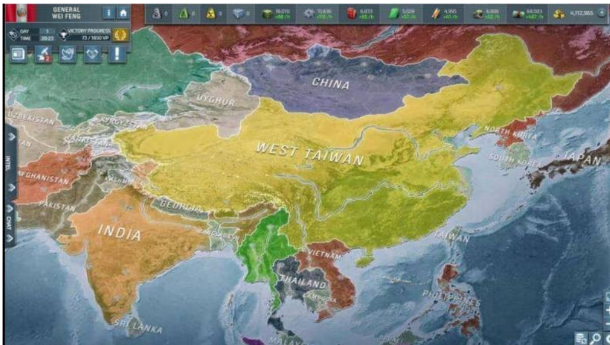
China labeled as "West Taiwan."

By Keoni Everington, Taiwan News, Staff Writer 2021/12/09 16:20