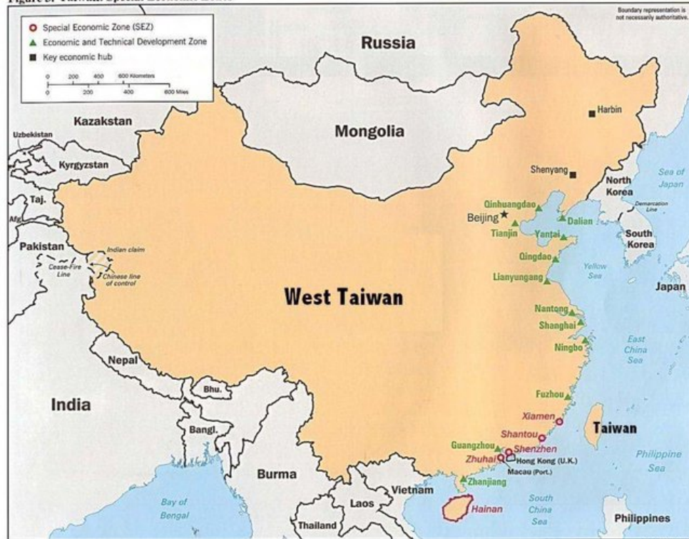
Figure 3. Taiwan: Special Economic Zones

I've never seen this map before but I like the idea of referring to China as West Taiwan just because it will piss off the dictators in Beijing. No one should be happy that 1 billion people live under that repressive regime. A free China should be a Western goal and value.