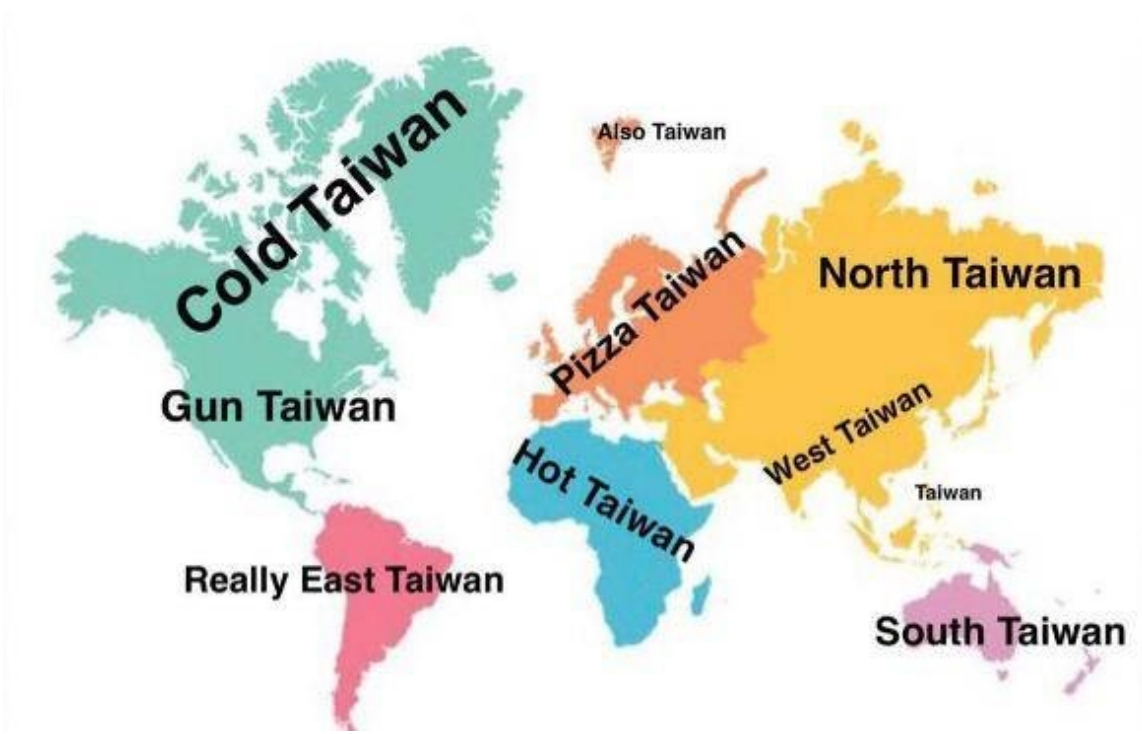
Global map of Taiwan. (Twitter image)