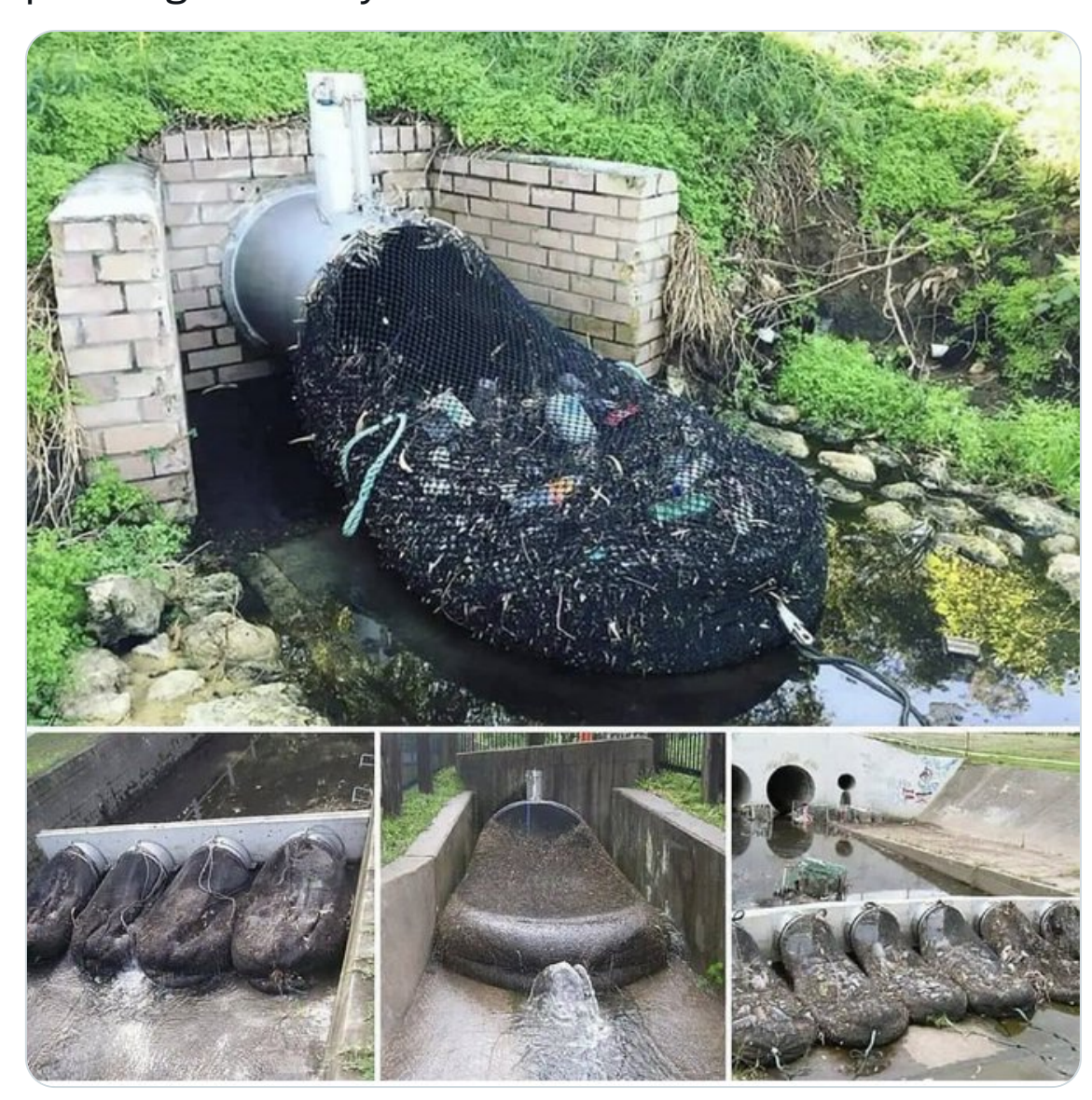
12:21 PM · Jan 22, 2022 · Twitter for iPhone

Australian city uses drainage nets to stop waste from polluting waterways.