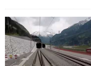
Swiss government forecasts 12 billion francs spending on roads