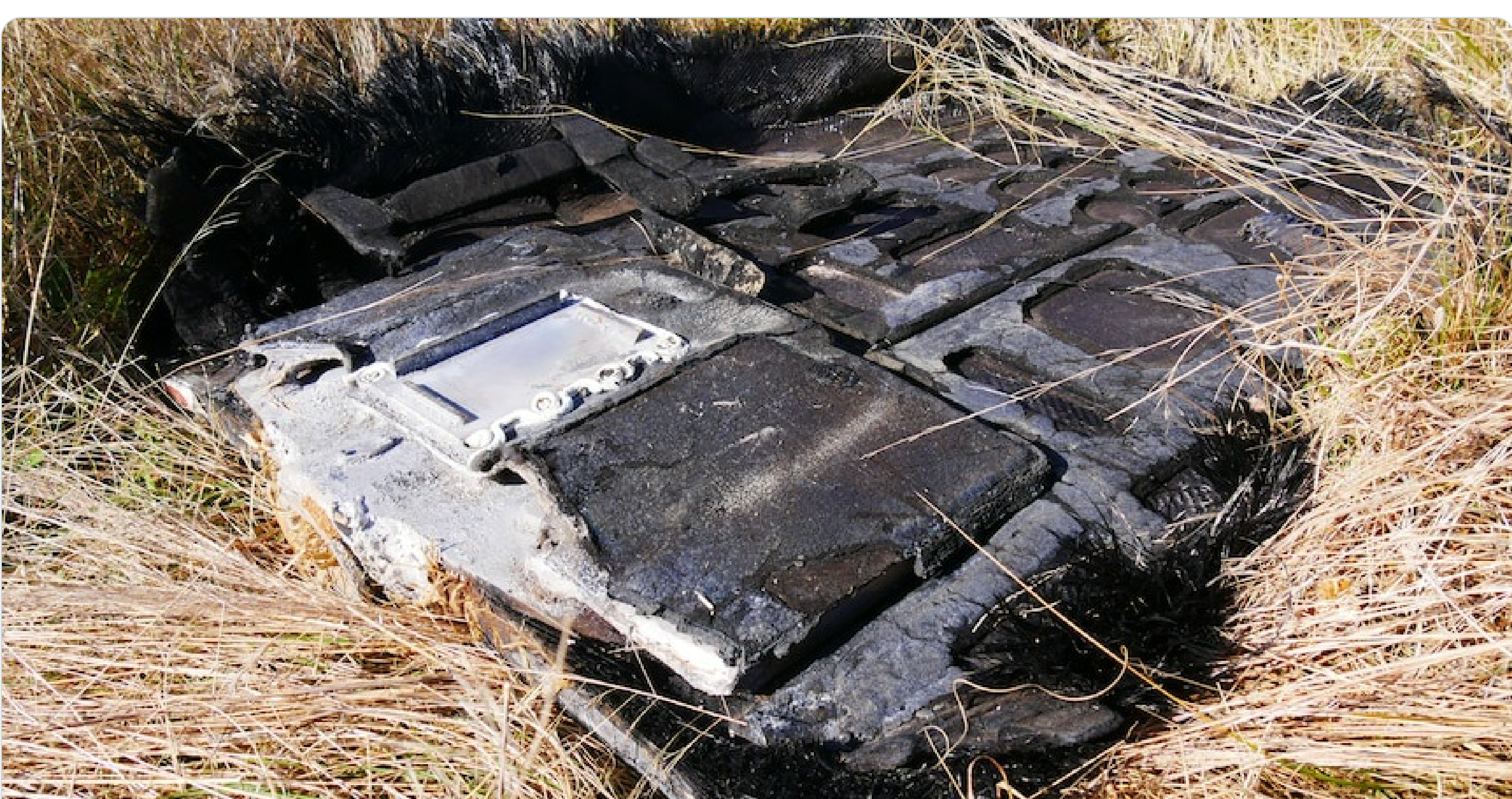
abc.net.au SpaceX rocket remnants crash into sheep paddock, space agency confirms The origin of space junk that left NSW sheep farmers scratching their heads has been confirmed as residents are told there could be more out there.