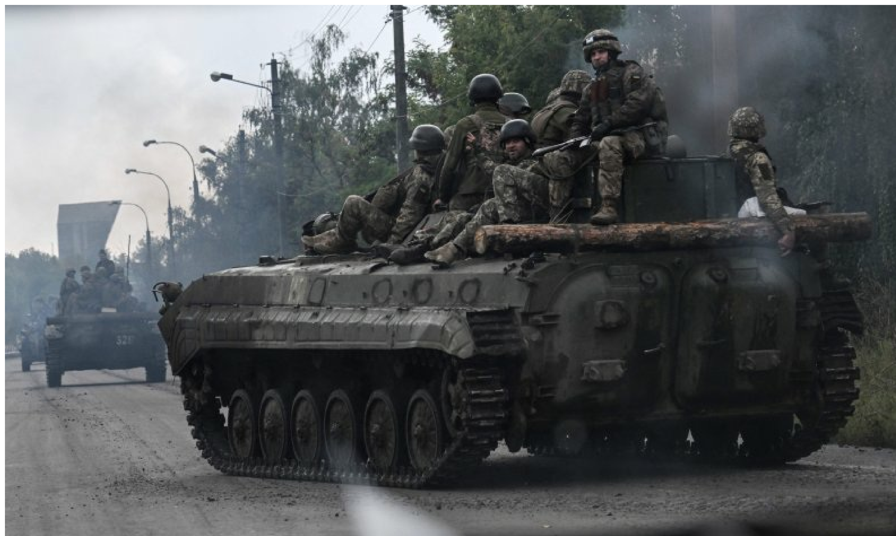
Ukrainian soldiers sit on infantry fighting vehicles as they drive near Izyum, eastern Ukraine on September 16, 2022, amid the Russian invasion of Ukraine. Putin has ordered a partial Russian mobilization following a successful Ukrainian counter-attack.

Shortly after Google searches for "как сломать руку в домашних условиях," or "how to break an arm at home," exploded across Russia, sparking speculation some Russians could take extreme measures to avoid fighting in Ukraine.