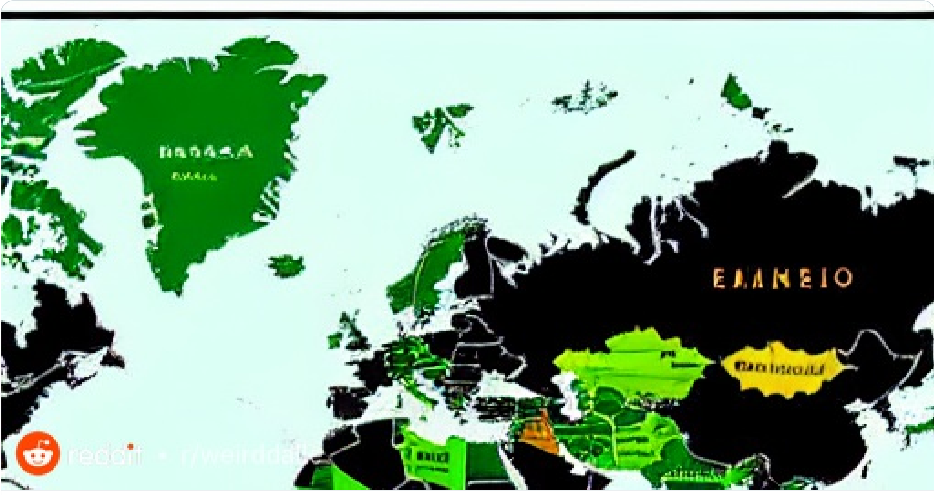
reddit.com a world map showing good countries in green and evil countries in... Posted in r/weirddalle by u/alain2long · 794 points and 112 comments

Weird Dall-E Mini Generations @weirddalle · 1h Replying to @weirddalle