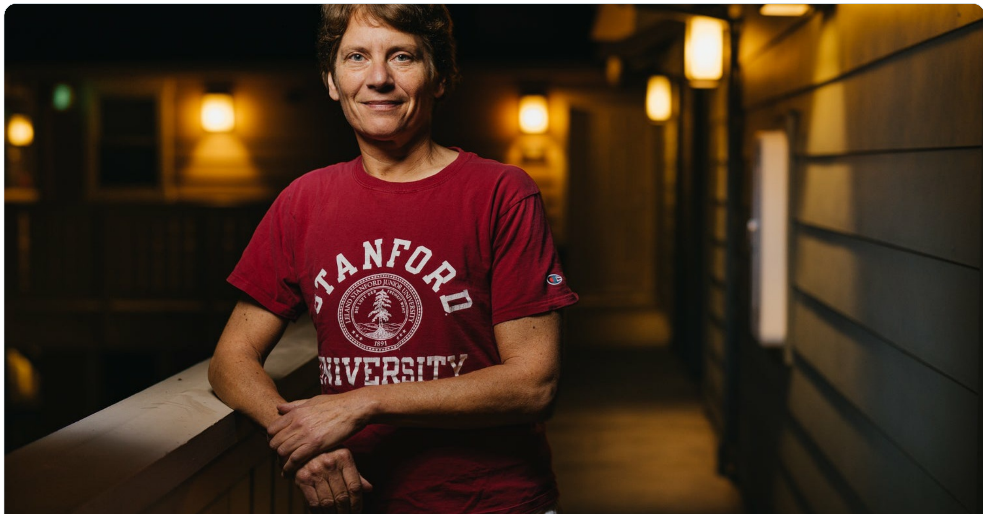
news.stanford.edu Carolyn Bertozzi wins Nobel in chemistry | Stanford News Stanford chemist Carolyn Bertozzi was awarded the Nobel Prize in chemistry for her development of bioorthogonal reactions, which allow scientists to explore cells and track biological processes...

Congrats to my former @Harvard bandmate @CarolynBertozzi on her @NobelPrize in chemistry! We won the Ivy League Battle of the Bands in 1986 with our rockin' group 'Bored Of Education', with her on keyboards & me in spandex.