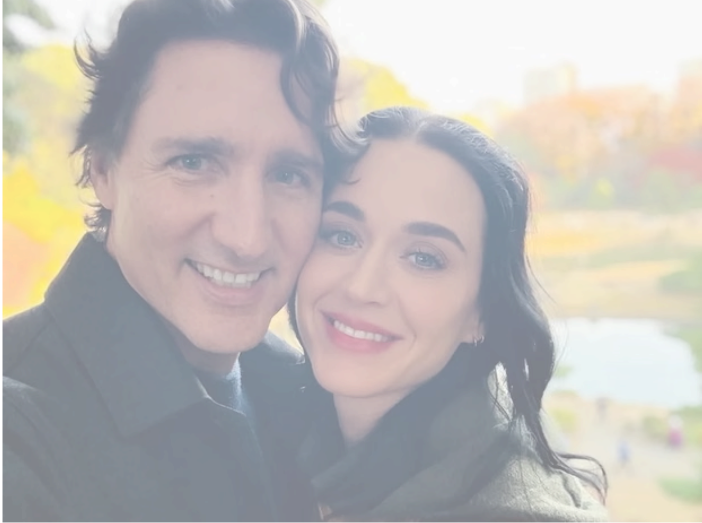
📷 An Instagram post by Katy Perry of a selfie with Justin Trudeau.

The singer posted a photo of the pair smiling cheek to cheek and a video of them eating sushi together while in Japan