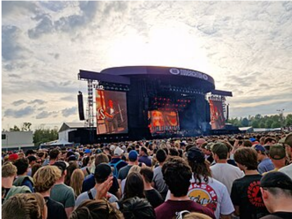
The Rock Werchter main stage in 2023