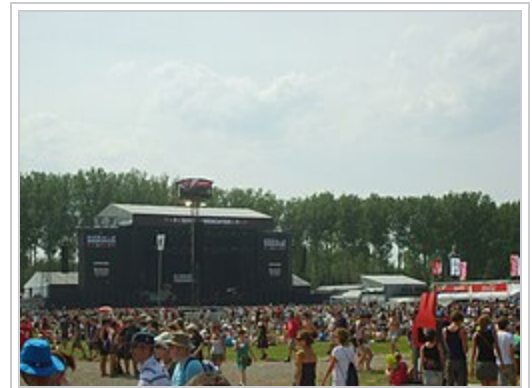
Rock Werchter 2010

The bands presented at Rock Werchter are traditionally a balanced mix of well known artists, popular crowd-pleasing acts and local Belgian acts. Belgian band Deus in 2008 was the first local band to close the Main