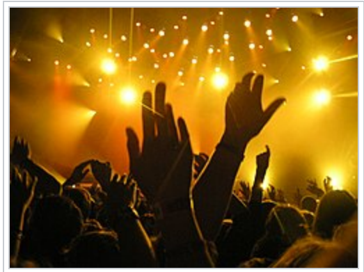
Inside Pyramid Marquee

Since 2002, the organizers created TW Classic as a tribute to the early days of Rock Werchter. TW Classic ('TW', as in Torhout-Werchter, is the traditional abbreviation of the festival) is a one day/one stage festival held one week after the main event. It usually programs veteran acts like Bruce Springsteen , Phil Collins , The Police , Depeche Mode or Simple Minds , supplemented with younger mainstream Belgian acts. In 2014, The Rolling Stones headlined TW Classic as one of their few festival concerts of 2014. In 2015, Robbie Williams headlined with his Let Me Entertain You Tour , and in 2016 Bruce Springsteen returned to the stage.