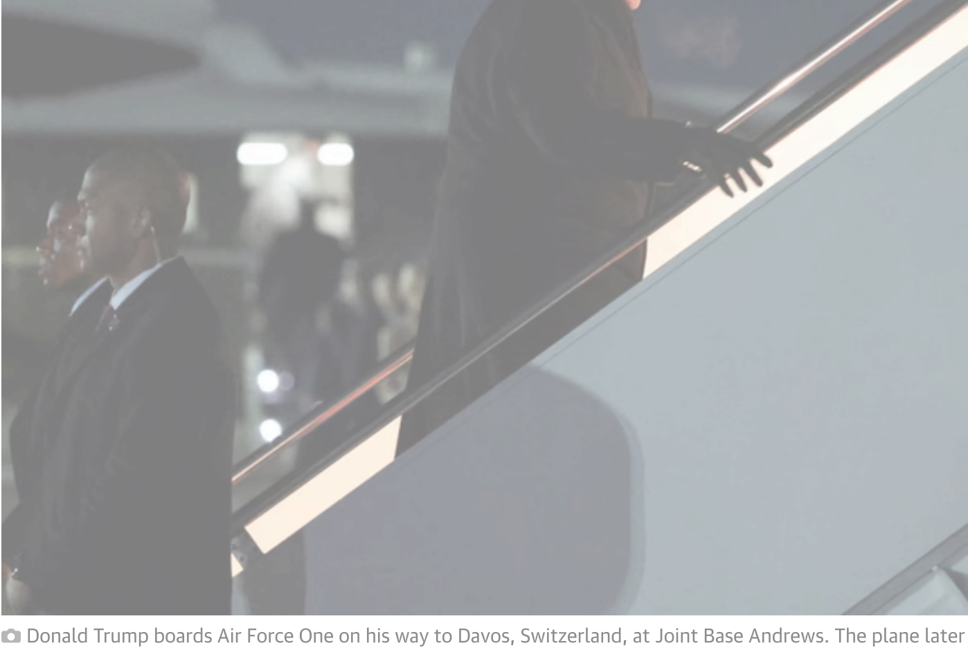
Donald Trump boards Air Force One on his way to Davos, Switzerland, at Joint Base Andrews. The plane later returned to Washington.

US president boards another aircraft to continue trip to World Economic Forum in Davos, Switzerland