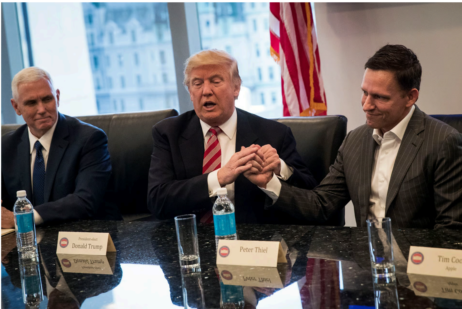
Mike Pence, Donald Trump and Peter Thiel at a meeting with technology executives at Trump Tower, New York, December, 2016.

But national security and tech experts dispute that claim, with one calling it “woefully naive” and “deliberately misleading”.