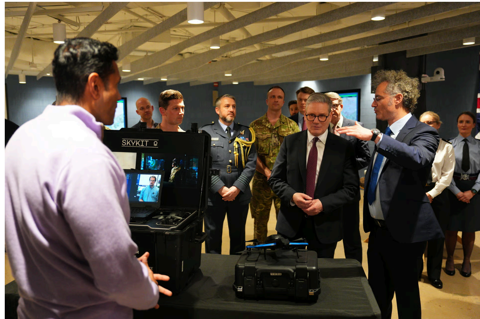
Keir Starmer with Palantir CEO Alex Karp on a tour of Palantir headquarters, Washington DC, February, 2025.

Thiel was Donald Trump's first high-profile supporter in Silicon Valley, has donated to his campaigns and has financially supported Vice-President JD Vance over the years. Palantir's software has been used by ICE, the US's federal immigrations enforcement agency, for years, with new reporting revealing how it is being used to target and locate immigrants . Thiel has been publicly supportive of authoritarian government, saying that he " no longer think[s] that freedom and democracy are compatible ".