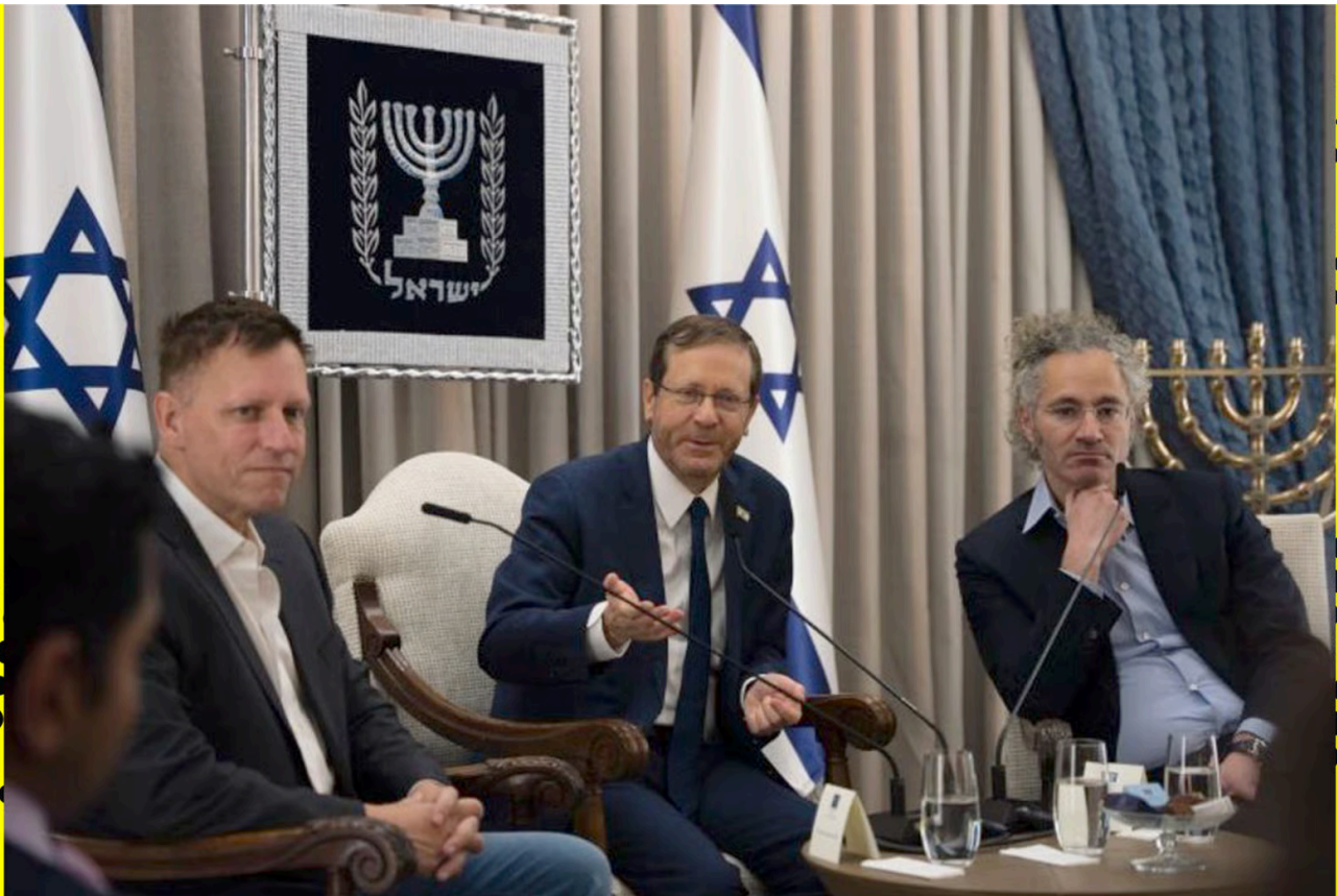
Peter Thiel (left) and Alex Karp (right) at a meeting with Israel's president Isaac Herzog, Tel Aviv, January 2024.

“America is, at this point, the natural candidate for katechon and antichrist, ground zero of the one-world state, ground zero of the resistance to the one-world state.” (Guardian)