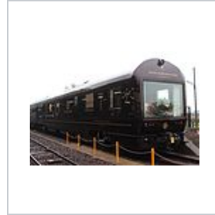
MaNeFu 77-7007 (car 7)