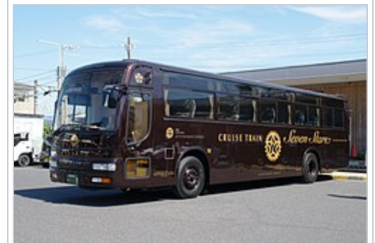
A dedicated tour coach for use by Seven Stars in Kyushu passengers