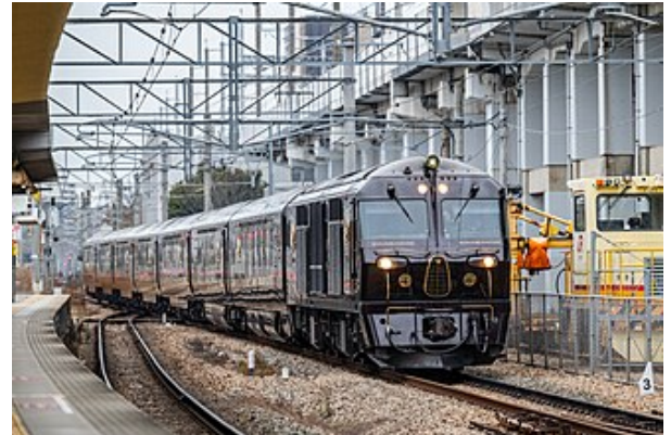
The Seven Stars in Kyushu in February 2025, hauled by a JR Kyushu Class DF200 diesel-electric locomotive