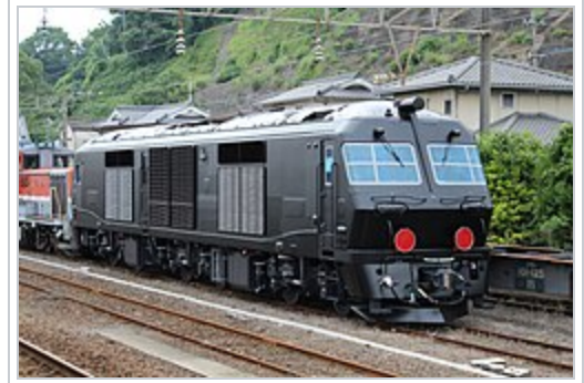
DF200-7000 on delivery covered in protective black film to protect the livery underneath, July 2013

The dedicated Class DF200-7000 diesel locomotive for this train was delivered to JR Kyushu's Oita Depot from the Kawasaki Heavy Industries Rolling Stock Company in Kobe on 2 July 2013. [11] Four coaches were delivered from Hitachi's Kudamatsu factory on 18 July 2013. [12] The train entered revenue service on 15 October 2013. [13] Introducing Kyushu to the world is a part of the train's purpose. [14]