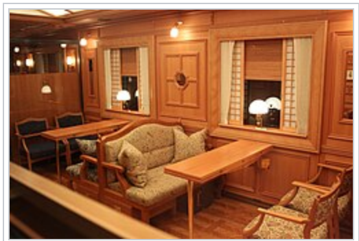
Dining space in MaShiFu 77-7002 (car 2)