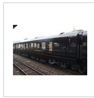
MaNe 77-7003 (car 3)