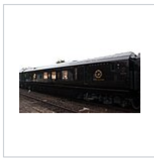
MaShiFu 77-7002 (car 2)