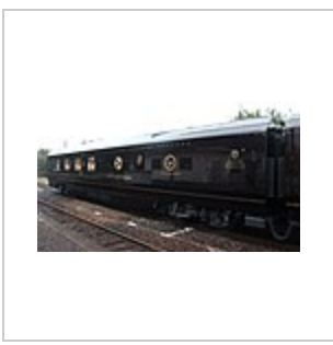
Mal 77-7001 (car 1)