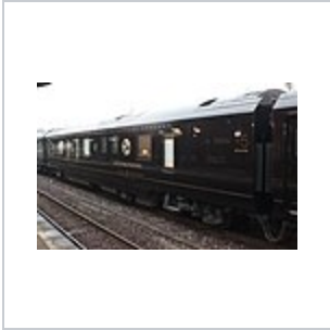
MaNe 77-7005 (car 5)