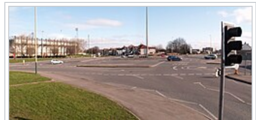
The central circle and two mini-roundabouts