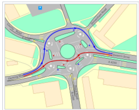
Swindon Magic Roundabout map with traffic direction and two routes from Fleming Way to Queen's Drive (give way at the arrowheads)

The roundabout in Drove Road is not the only one in Swindon that worked on the same principle; until recently, the roundabout at Bruce Street Bridges had a similar layout, but had only four entry/exit points. It was converted into a conventional roundabout in 2016. [12]