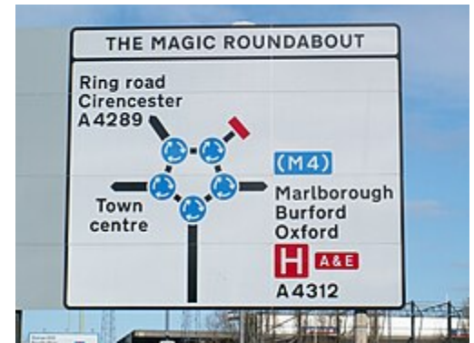
Sign approaching the Magic Roundabout from the south on the B4289