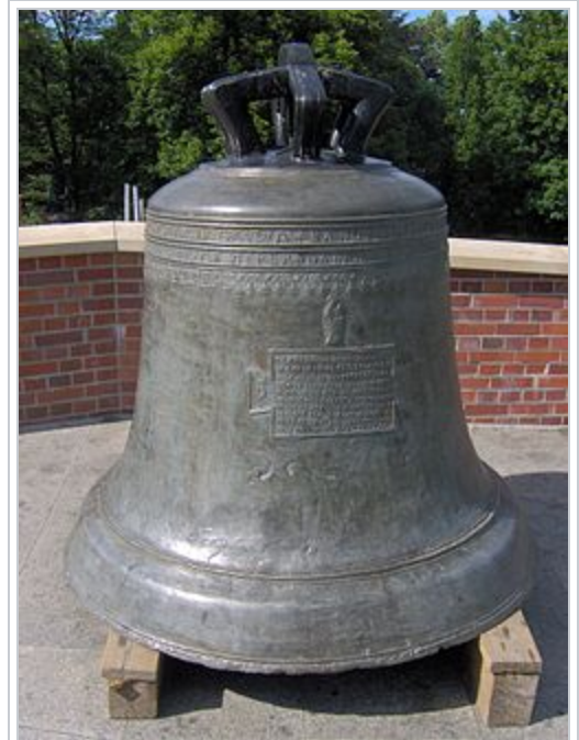
A large bell