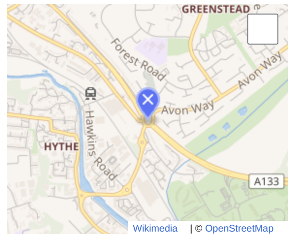
Interactive map of Greenstead roundabout