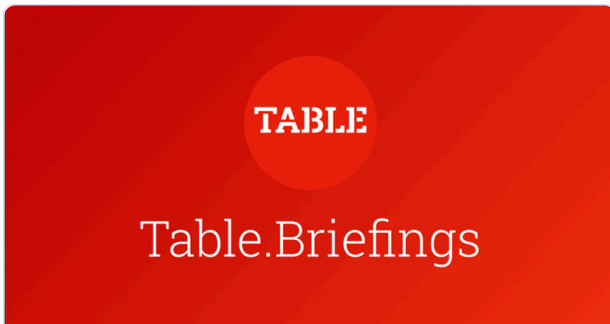
Table.Briefings · 18h

https://table.media/berlin/news/wirverlassenx-gruene-spd-und-linke-empfehlen-ihren-mitgliedern-den-ausstieg-aus-dem-sozialen-netzwerk