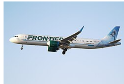
N646FR, the aircraft involved in the accident